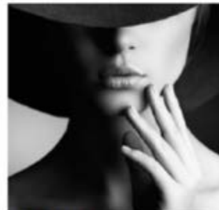
Take a tour

Learn how use STUDIO ancillaries, request examination copies, and access instructor resources.